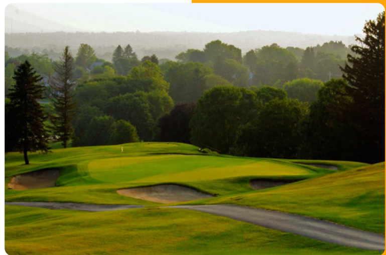
7th Hole, Bellevue Country Club

Your support of our mission and work helps transform the lives of the more than 20,000 people we serve each year.