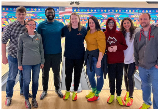
Recovery Center Staff and Supporters