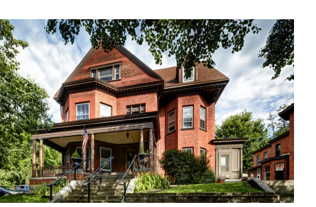
Green Street Men's Community Residence in Syracuse, NY

Helio Health -- and its affiliates Central New York Services and Insight House -- operate a wide variety of residential services to help people at every stage of the recovery process. From intensive residential programs - like Elements of Central New York and Insight House Residential Rehabilitation - to supportive housing programs, residential options span the full continuum.